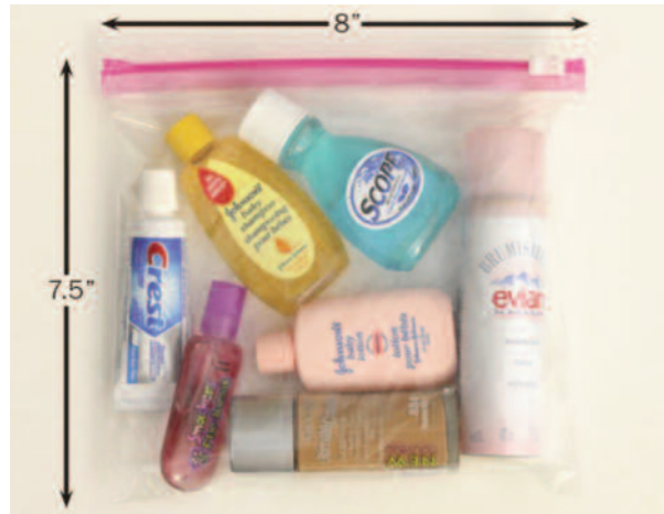
Sample zip-top bag for liquids in carry-on luggage